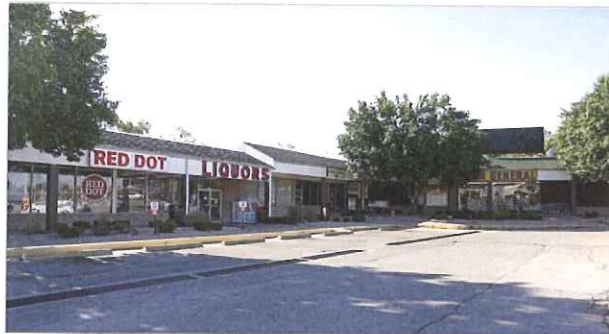
Anchored by Dollar General