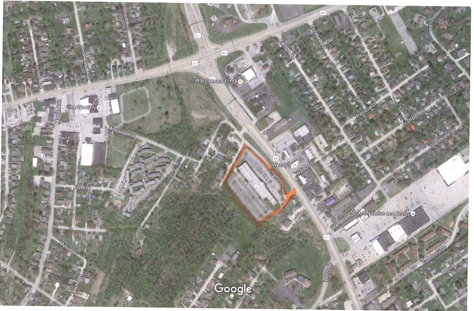
200 ft