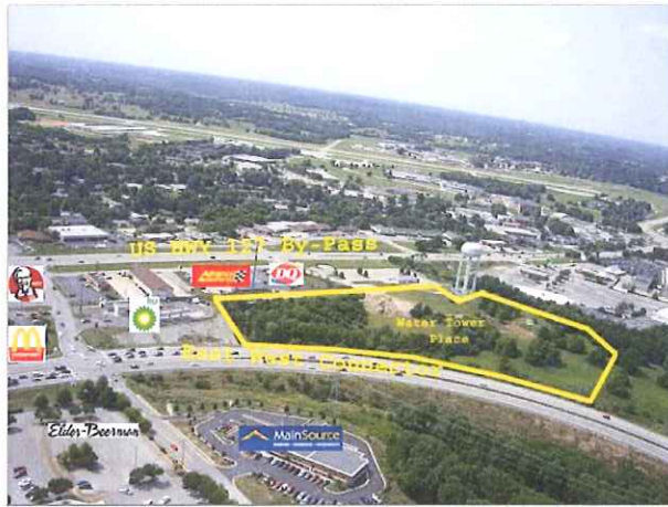
Water Tower Place